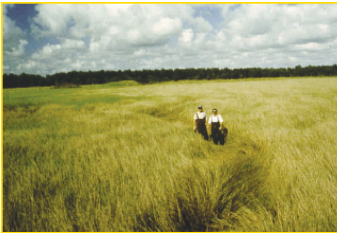
Dense torpedograss has overtaken many shallow areas of Lake Okeechobee's western marsh where fragrant water lily formerly bloomed. Here the torpedograss nearly dwarfs SFWMD researchers.