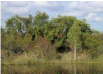
Figure 2. Top – Typical L. microphyllum infested tree island. Bottom – Tree island 2217D immediately following treatment, November 1999.

slowly increasing in all vegetative layers. This was expected and is consistent with monitoring post-treatments of other Category 1 invasive pest plants. Nineteen native species were recorded in the study plots. The native species list was similar to that reported on other refuge tree islands (Brandt and Black 2001, Brandt et al. in prep, USFWS 2001). The dominant native species in the ground layer were ferns (swamp, chain, and shield) and herbs and forbs such as marsh beggar's-tick and bog