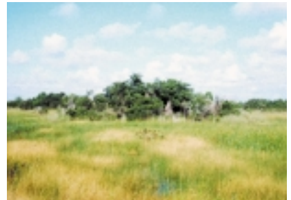
Figure 3. Top – Tree island 2217D plot (9 months post-treatment). Note dead fern trellises hanging in foreground. Bottom – Tree island 2217D exterior photo point (20 months post-treatment).

microphyllum . This appeared to be a faulty treatment technique by the contractor. It may be that the fern trellises were cut and that the subsequent spray crews failed to treat the portion rooted or that the islands were not treated at all. Also, a faulty herbicide mixture may have been used, or the herbicide may have been washed away in a rain event. A better means of marking the individual islands needs to be developed if future treatments are going to be conducted in this same manner.