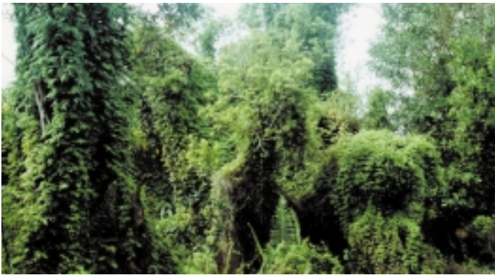
Figure 4. Improperly treated L. microphyllum on tree island 2217A adjacent to plot. This Lygodium was brown and appeared to have been treated during initial visits but had recovered fully as of March 2002. This island would be an ideal candidate for immediate re-treatment to prevent reinfestation of other successfully treated islands in close proximity.