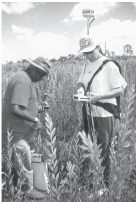
USDA researchers use GPS technology to track the progress of the country's first melaleuca biocontrol agent, Oxyops vitiosa in Florida.

have only 100 meter accuracy, and there will be no way to improve that accuracy, either in the field or the office (unless you also have PPDGPS capability, or want to stay on one location for an extended period of time so you can average the results). PPDGPS does not depend on remaining in contact with a reference station. RTDGPS is also somewhat less accurate than PPDGPS, but the difference is generally negligible for all but the most demanding applications. In the past, RTDGPS had other disadvantages having to do with the complexity and expense of implementing RTDGPS relative to PPDGPS, especially for implementing the most dependable solutions. However, as with most emerging technologies, costs continue to drop and performance improves. In the last year or so RTDGPS solutions have begun to appear that approach the cost-effectiveness and dependability of Trimble units.