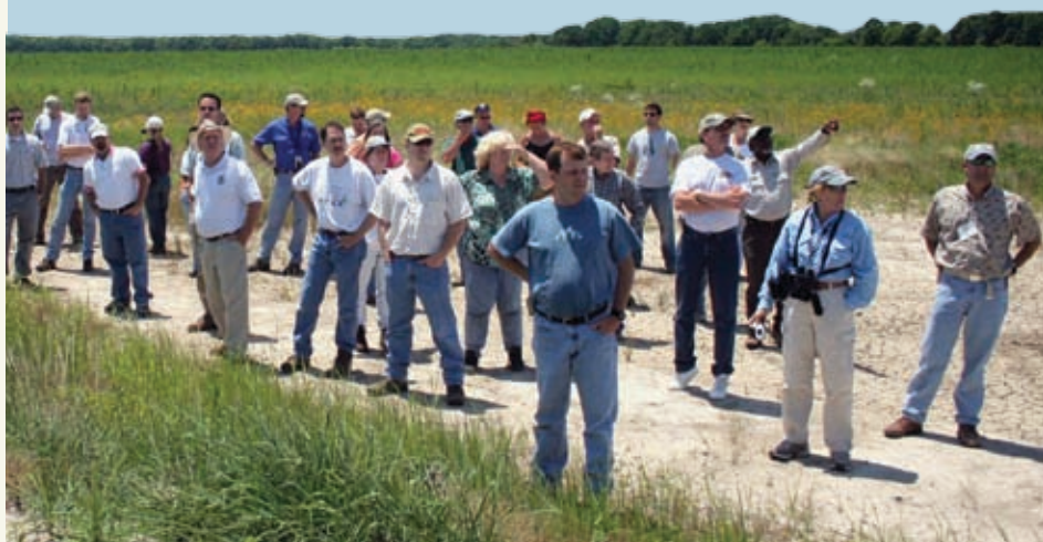
Private landowners at cogongrass demonstration meeting hosted by Osceola CWMA.