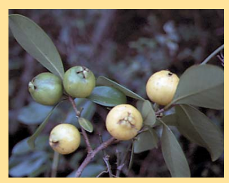
Psidium cattleianum var. lucidum

unmistakable in the places where it is found. Its crown is round and quite dense. The fruits are yellow, as well as the endocarp that ranges from light yellow to white. In Parana State it is distributed along the coast, and on the first and second plateaus.