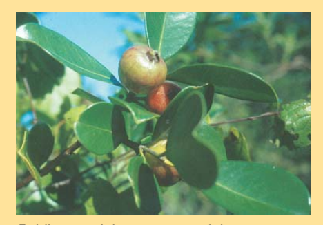
Psidium cattleianum var. cattleianum

The red form is a tree, with heights from 2.5 meters up to 20 meters. Its trunk has the same color of the yellow form although it differs in shape being straight and cylindrical with a larger diameter. Its crown is slightly elongated and quite dense. Its fruit and its endocarp are red colored. In the Araucaria Forest it is found inside the woods but exclusively in the first plateau, ranging from 6501100 m. The climate is hot and humid, with temperature between 15 - 19 °C and 1250 - 2500 mm annual rainfall.