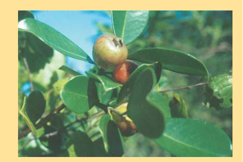
Psidium cattleianum var. cattleianum

The red form is a tree, with heights from 2.5 meters up to 20 meters. Its trunk has the same color of the yellow form although it differs in shape being straight and cylindrical with a larger diameter. Its crown is slightly elongated and quite dense. Its fruit and its endocarp are red colored. In the Araucaria Forest it is found inside the woods but exclusively in the first plateau, ranging from 6501100 m. The climate is hot and humid, with temperature between 15 - 19 °C and 1250 - 2500 mm annual rainfall.