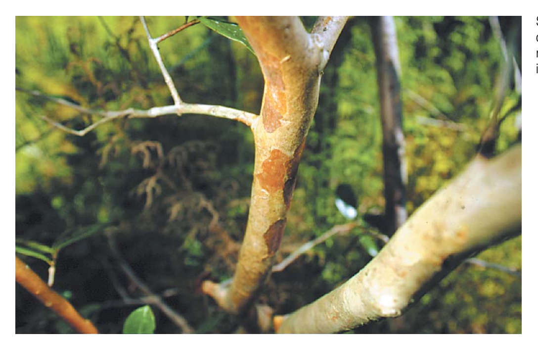
Strawberry guava has characteristic gray-brown to reddish bark that peels off in irregular patterns.