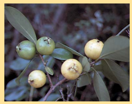
Psidium cattleianum var. lucidum

unmistakable in the places where it is found. Its crown is round and quite dense. The fruits are yellow, as well as the endocarp that ranges from light yellow to white. In Parana State it is distributed along the coast, and on the first and second plateaus.