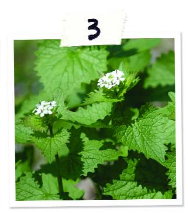
garlic mustard (Alliaria petiolata)