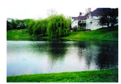
TopFilm <sup>™</sup> makes algaecide stick to algae

(Outperforming all current surfactants tested to date)