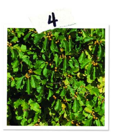
Oriental bittersweet (Celastrus orbiculatus)

Four invasive plant species, generally unknown to the public, are posing significant threats to the Georgia landscape and have a high potential to become widespread if left unchecked. The Georgia EPPC has sponsored several workshops and field days to highlight these and other invasive plant species, raise awareness of the problem and help equip participants to deal with the emerging threats.