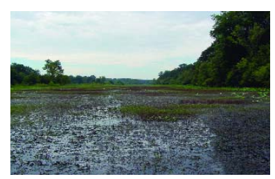
Treatment with Standard Surfactant

Locate Your Distributors: www.biosorb-inc.com