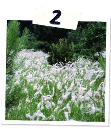
cogongrass (Imperata cylindrica)