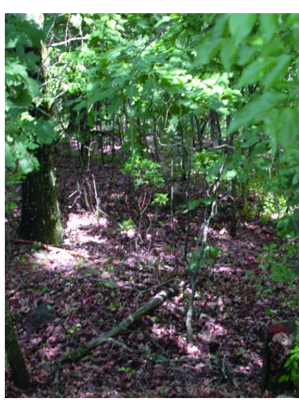
Garlic mustard before (left) and after removal on Kennesaw Mountain.