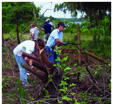
Volunteers cutting and dragging Brazilian pepper branches at Sun City Heritage Park, Ruskin

times per year and the number of volunteers increases each time. The ISTF has received over $250,000 in grant funding to produce public outreach and education materials and remove invasive species from public lands. Many of the ISTF members provide outreach to the Tampa Bay area. The Tampa Electric Company (TECO) produced a bill insert explaining invasive plants and distributed it to cus-