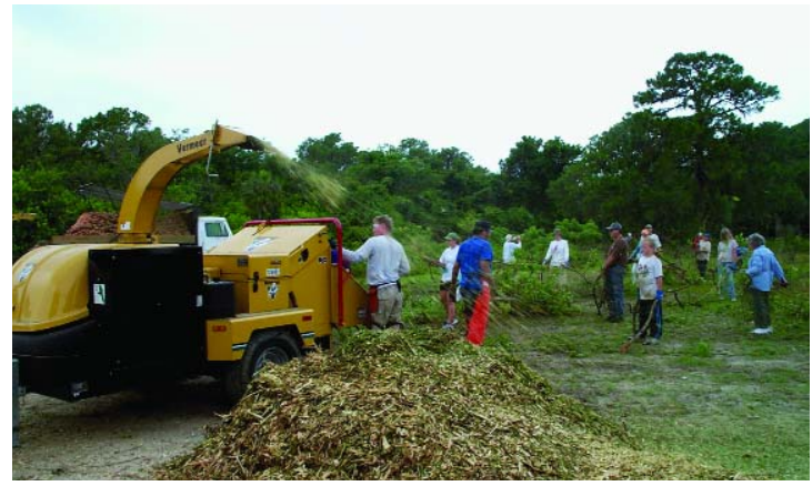
Work Day volunteers handing branches to County staff to be chipped