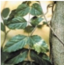
Wisteria ( Wisteria floribunda )

By August, it's time to treat the few remaining kudzu ( Pueraria lobata ) and wisteria ( Wisteria floribunda ) sites left at old homesites. The