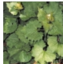
Garlic mustard ( Alliaria petiolata )

Garlic mustard ( Alliaria petiolata ) is a biennial herb in the mustard family. First recorded in the U.S. around 1868 from Long Island, New York, it was introduced by European settlers as a medicinal herb. Its leaves have a garlic-like odor when crushed, and its white flowers develop into prolific tiny seeds