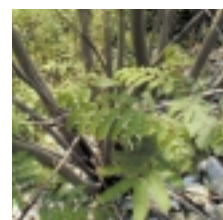
Mimosa ( Albizia julibrissin )

June and July are the best times to survey for paulownia or princess tree ( Paulownia tomentosa ), mimosa ( Albizia julibrissin ) and ailanthus or tree of heaven ( Ailanthus altissima ), since these invasive trees bloom during that time. Seedlings are hand-pulled, but larger stems must be cut and stump treated. One of our most difficult sites overall has been a 500 acre wildfire site that burned in the summer of 1999 and was subsequently invaded by paulownia, ailanthus and woolly or common mullein ( Verbascum thapsus ). Seeds of these plants blew in from large infestations just outside the Park boundary and quickly became established on the mineral soil left by the fire. Thousands of seedlings have been removed; some areas averaged 40 paulownia seedlings per acre. With no canopy left in many parts of the burned area, paulownia was in good position to become a dominant species. In November 2001 one of the largest fires in Park history burned 7000 acres on the North Carolina side of the Park. Unfortunately the southern boundary of the fire, just outside the Park, was an old municipal watershed area badly infested with paulownia and ailanthus. The Park received funds through fire rehabilitation to begin surveying and controlling exotics on this fire site.