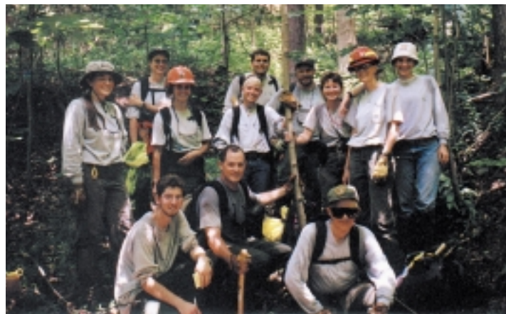
Crew after a hard day of killing paulownia on the Blacksmith 500 acre fire site.

Multiflora rose ( Rosa multiflora ) has leafed out by late April and early May, somewhat ahead of most native shrubs and thus easily visible. Small clumps of rose are easily treated by basal bark applications of triclopyr/oil in other seasons, but dense thickets of rose have been successfully treated with foliar applications of glyphosate. The Little Cataloochee section of the Park is a remote area where old homesites have been overgrown by multiflora rose that was planted in the 1930's as an erosion control (just prior to the Park's establishment). We estimate that by the late 1980's, when control was begun, over 12 contiguous acres of rose grew in thickets of various sizes throughout the Little Cataloochee area. Herbicide applications in this area are difficult due to the remote location (work crews must camp out) and the distance from water. In order to mix herbicide, water must be pumped up to holding tanks using equipment from wildland firefighting operations including portable pumps, fire hose and folding tanks. Now that native plants occupy many of the former rose sites, treatments are still performed in spring to reduce non-target impacts and for easier access.