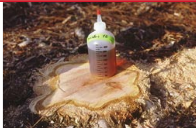
Figure 1. The final cut was made as close to the ground as possible and herbicide was applied to the area just inside the bark with a dropper bottle.

common formulation used in the United States. Products that contain different concentrations of glyphosate and adjuvants have been marketed over the years. Common products for terrestrial use contain 41.0% glyphosate as the isopropylamine salt, which is equivalent to 3 lb glyphosate acid per gallon, plus added surfactant. Products registered for aquatic use contain 53.8% glyphosate as the isopropylamine salt, which is equivalent to 4 lb glyphosate acid per gallon, and contain no surfactant. Touchdown, a recently developed product by Syngenta, contains 28.3% glyphosate as the diammonium salt of glyphosate, which is equivalent to 3 lb glyphosate acid per gallon, plus added surfactant (Table 1).