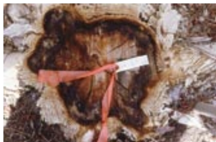
Figure 2. By 84 days after application all herbicide treated melaleuca stumps were exhibiting signs of mortality.