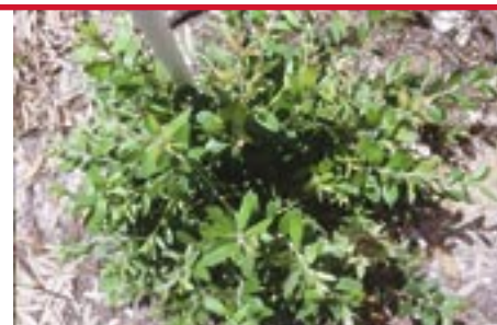
Figure 3. By 84 days after application, untreated melaleuca stumps averaged 10 adventitious stems per stump.

Brazilian pepper stumps ranged from 6cm to 30cm in diameter