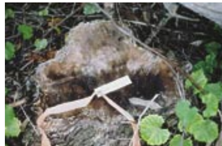
Figure 5. By 70 days after application, herbicide treated Brazilian pepper tree stumps were exhibiting signs of mortality.

ation for his assistance in locating a site for treatment of melaleuca trees and to Dan Austin for assisting with access to the FAU Preserve. This study was funded in part by a grant from Syngenta Crop Protection, Inc. The herbicides used in this study were provided by Syngenta Inc., Monsanto Co., BASF Inc., and Dow AgroSciences. Published with the approval of the Florida Agricultural Experiment Station as Journal Series No. N-02179.