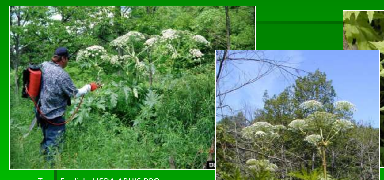
Terry English, USDA APHIS PPQ, Bugwood.org