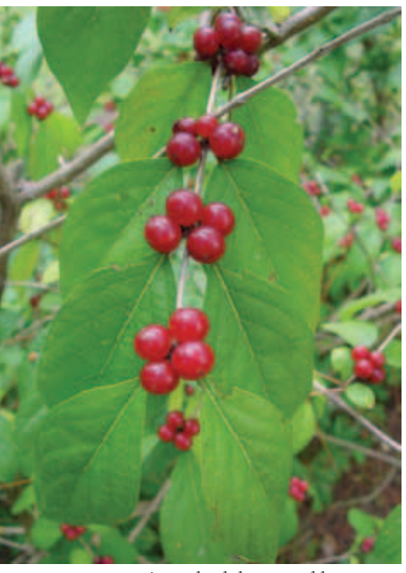
Amur bush honeysuckle (Lonicera maackii)

montana var. lobata), and Amur bush honeysuckle (Lonicera maackii). See Figure 3 for frequencies of all species reported.