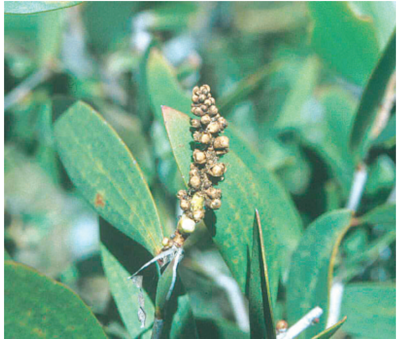
Fig 5. Melaleuca flower bud which has been consumed by the larvae of the tip-feeding moth, Holocola sp.

Research efforts are now being driven toward developing agents that could diminish the vast reproductive potential of melaleuca. Research conducted in collaboration with ABCL staff by Van, Rayachatterjee and Center (ARS-Ft. Lauderdale) compared reproductive potential of melaleuca trees in Florida and Australia. This work demonstrated that abortion of flower buds was a significant factor in reducing the regenerative potential of M. quinquenervia in its native habitat. Much of the flower abortion appears to be caused by small moth larvae that bore through buds and immature inflorescences which terminates flower formation and ultimately curtails seed development. At least one species, Holocola sp. (Fig. 5) attacks both leaves and flowers, allowing it to persist year round without dying out following the flowering season, an important factor if it is to be released as an agent in Florida. Attempts will be made to colonize and evaluate these moths over the next year.