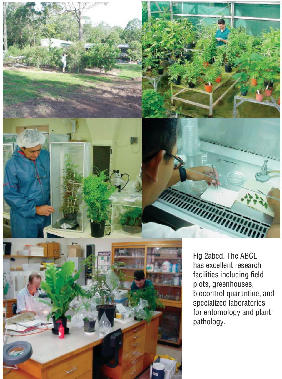
Fig 2abcd. The ABCL has excellent research facilities including field plots, greenhouses, biocontrol quarantine, and specialized laboratories for entomology and plant pathology.

Research conducted at ABCL follows a sequence of events involving