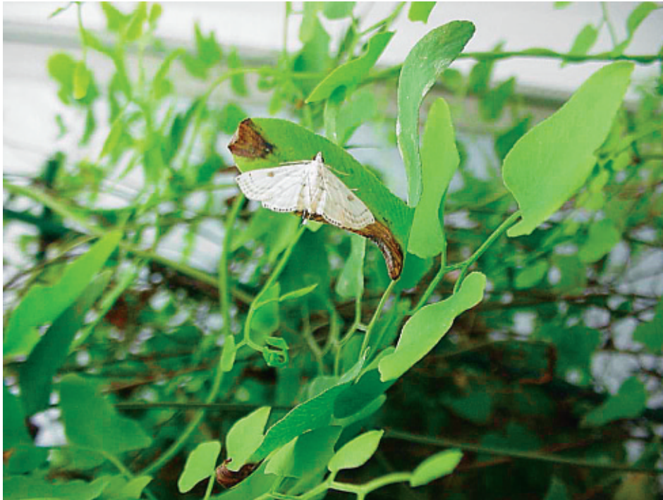
Fig 6. The pyralid moth, Cataglyphis camptozonale was collected from in southeast Queensland and is being evaluated as potential biological control agent of Lygodium microphyllum .

Environmentally adapted plant flora coupled with globalization of trade and travel between Australasia and the Southeastern U.S. is now and will continue to be the cause of many serious weed invasions. The Australian Biological Control Laboratory is committed to research and development of biological control solutions for U.S. weeds of Australian and Southeast