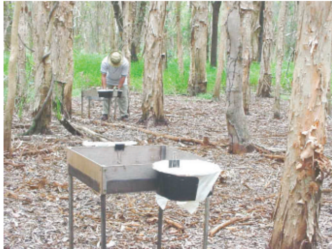
Fig 3. Pictured here is Alex Racelis (ARS-Ft. Lauderdale) collecting seed rain samples from a native stand of Melaleuca quinquenervia in Queensland for comparative ecological studies.

determination of the native distribution of a weedy plant species, exploration for natural enemies, DNA fingerprinting of newly discovered species, ecology of the agents and their weed hosts, field host-range surveys, and ultimately preliminary host-range screening of candidate agents. Our research determines what regulates the plant in its native environment, which brings to light the full array of potential biological control agents. Organisms with a narrow host range and good regulatory potential are intensively investigated further. The data we gather on potential agents is combined with information about the ecology of the weed where it is invasive. Our stateside USDA-ARS collaborators use a science-based process to make the final decision on which organisms are best suited to be biological control agents. This dual-continent