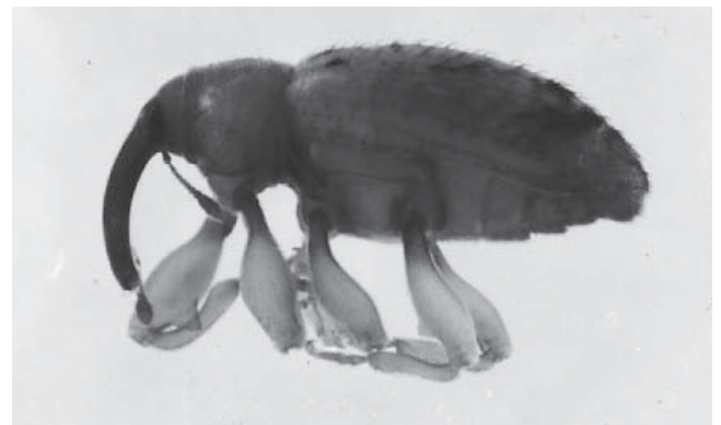
Figure 5. Ligustrum seed weevil Ochyromera ligustri , an insect natural enemy of Chinese privet.