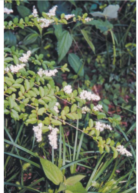
Figure 3. Branchlet of Chinese privet with leaves and flowers.

Chinese privet can grow to a height of 10 m. The plant is characterized by its numerous leafy pubescent branchlets, and its small, simple, deciduous to semi-deciduous leaves are elliptic in shape (Fig. 3). The leaves are green (variegated in cultivation), opposite, have short pubescent petioles, and are attached at right angles to the stems. In bloom, the branchlets bear numerous, many-flowered panicles. Flowers (Fig. 3) are white and malodorous; the corolla tube is shorter than the spreading lobes, and the stamens are exerted. The fruits (Fig. 4) are blue, fleshy drupes that are ingested by birds (McRae 1980, Buchanan 1989, Montaldo 1993). New infestations probably develop from bird-dispersed seeds (Montaldo 1993).