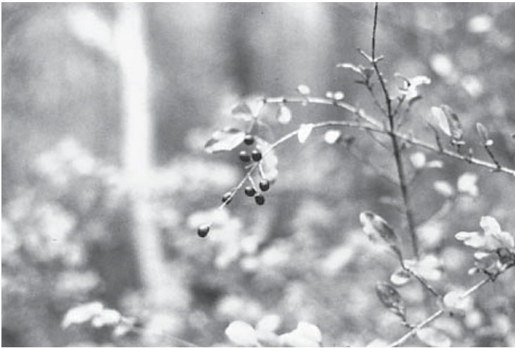
Figure 4. Berry-like fruits of Chinese privet.

The Florida Exotic Pest Plant Council lists Chinese privet as a Category I invasive species (FLEPPC 1996). The shrub disrupts native plant communities in riparian and upland habitats by competing for the available light and space. The federal- and state-listed endangered Miccosukee gooseberry, Ribes echinellum , is on the verge of being displaced in Florida by encroaching stands of Chinese privet (Langeland and Burks 1998). Moreover, nutrient cycling in natural areas can be disrupted by the presence of Chinese privet. Faulkner et al. (1989) observed that dense thickets of Chinese privet in Tennessee produce large quantities of litter, and act like umbrellas by preventing the infiltration of leaf litter from the native tree canopy. Agriculture and public health also can be impacted by the presence of Chinese privet. Dense stands of this invasive shrub can serve as alternate host plants for the citrus whitefly, Dialeurodes citri (Hicks and Oliver 1987), and are conducive to infestations of the hard tick Ixodes scapularis , a suspected vector of Lyme disease in the southern United States (Goddard 1992).