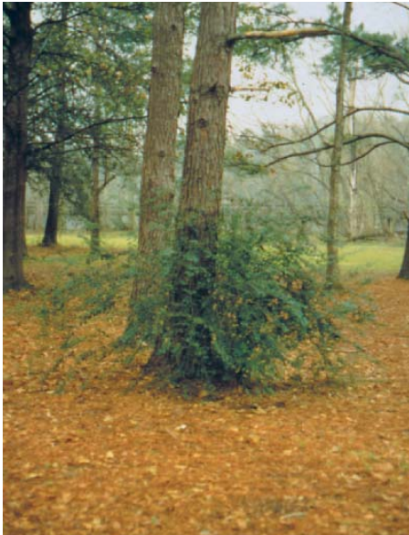
Figure 1. Chinese privet growing in a conservation area in north Florida.