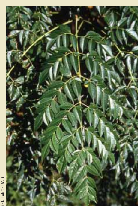
Chinaberry ( Melia azedarach )