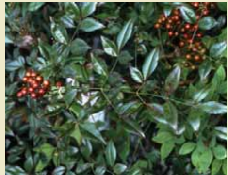
Nandina (Nandina domestica)

Rank 2 - Significant Threat: Exotic plan as R