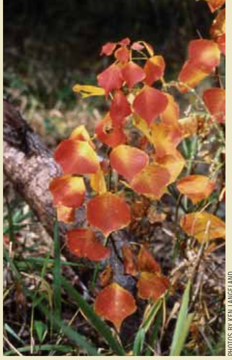
Chinese tallowtree (Sapium sebiferum) with fall foliage