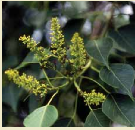
Chinese tallowtree (Sapium sebiferum)