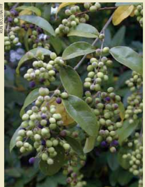
Chinese privet (Ligustrum sinense)