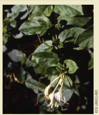
Japanese honeysuckle (Lonicera japonica)