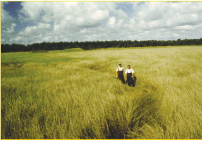
Dense torpedograss has overtaken many shallow areas of Lake Okeechobee's western marsh where fragrant water lily formerly bloomed. Here the torpedograss nearly dwarfs SFWMD researchers.