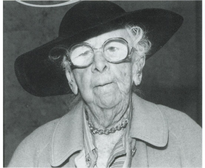
MARJORY STONEMAN DOUGLAS 1890 -1998

When Marjory Stoneman Douglas was only fourteen years old, Napoleon Bonaparte Broward was campaigning for governor of Florida. His platform centered on the Everglades, and he began accusing the railroad barons of "draining the people and not the swamp." His most famous phrase, "Water will run down hill!", always received standing ovations during his campaign speeches, as he explained how, if elected, he would "knock a hole in the wall of coral (the Miami Rock Ridge), and let a body of water obey a natural law and seek the level of the sea . . ." He profited politically from the widespread discontent and sentiment of the times and was elected in 1905. During the first year as governor, Broward ordered the first dredges to start their slow, grinding trek through the sawgrass and change the Everglades forever.